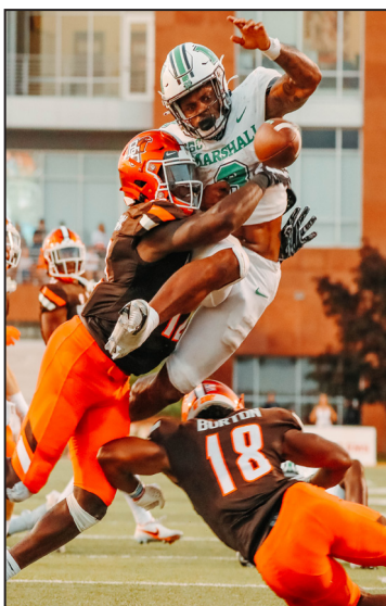
Bowling Green has forced 10 turnovers over its last four games with six interceptions and four fumble recoveries. Against Marshall last time out the Falcons forced two fumbles inside its own five-yard line.