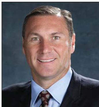
DAN MULLEN Head Coach Ninth Season