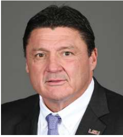
Ed Orgeron Head Coach