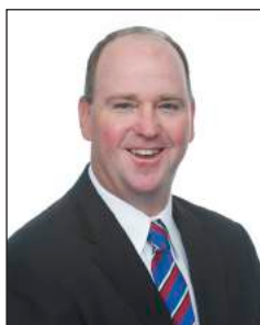
SKIP HOLTZ Head Coach