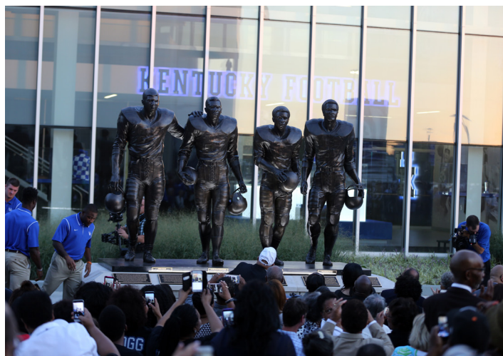
The statues honoring the first four black men to break the color barrier in SEC football stands in front of UK's new practice facility.

in all six games this season and has 23 tackles with two interceptions, including one in back-to-back games.