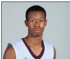
RODNEY HOOD • Fr • G • 6-8 • 204 • Meridian, MS