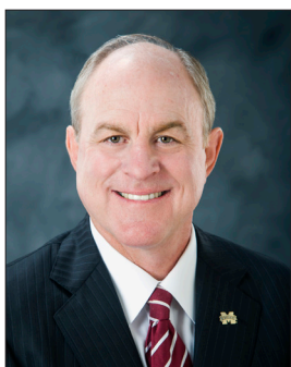
Ben Howland Head Coach 2nd Year