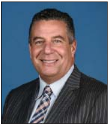
Bruce Pearl Head Coach