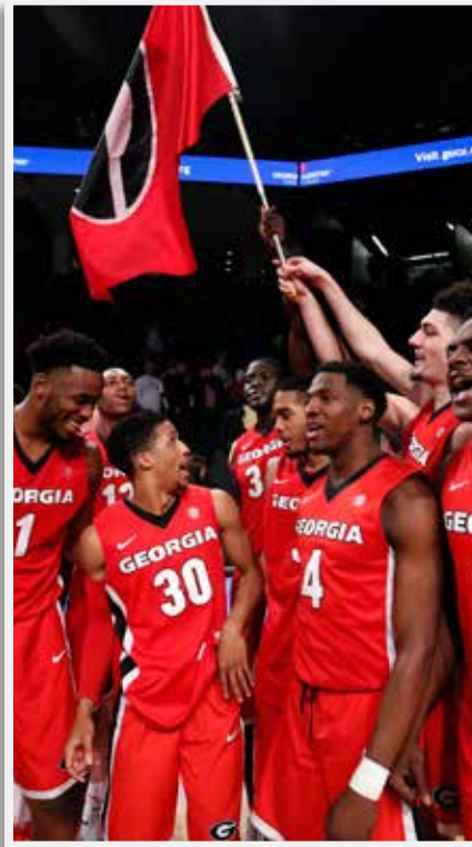
Georgia's 17-point victory at Ga. Tech was the Dogs' second-largest road margin ever over GT, second only to a 69-13 win in 1909.