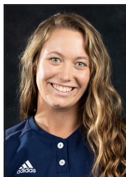
#9 • Kelly Park Greenville, Pa.