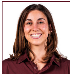
Trinity Holland Mid Distance / XC