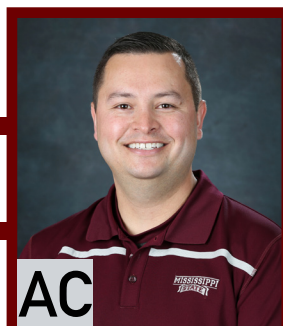
AC MISSISSIPPI STATE