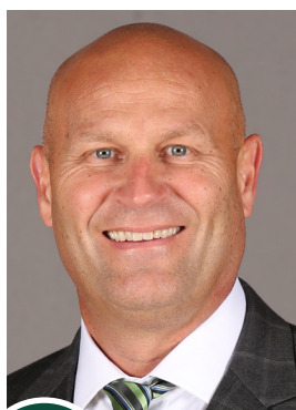
HC Kelly Graves @GoDucksKG