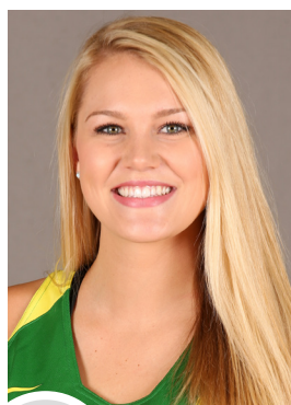
44 Mallory McGwire @mallorymcgwire