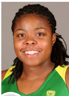
32 Oti Gildon @OtiGildon