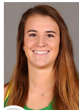
20 Sabrina Ionescu @sabrina_i20