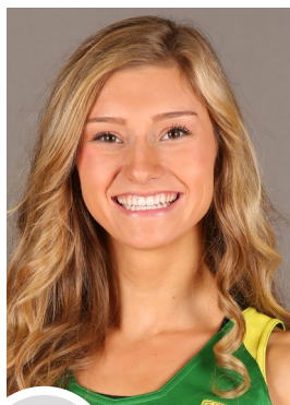
14 Lydia Giomi @Lydiagiomi