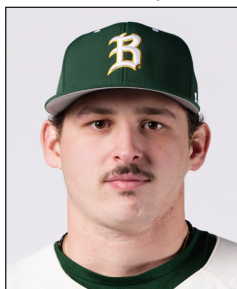
43 BROOKS HOUSE R-SO - RHP Winder, Ga.