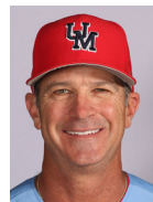
5 • Mike Bianco Head Coach 26th Season