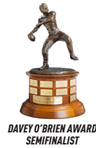
DAVEY O'BRIEN AWARD SEMIFINALIST