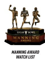
MANNING AWARD WATCH LIST