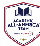
ACADEMIC ALL-AMERICAN CANDIDATE