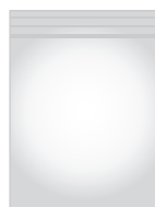
CLEAR PLASTIC BAG ONE GALLON RESEALABLE