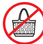
PRINTED PATTERN OR TINTED BAG