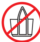
LARGE TOTE BAG