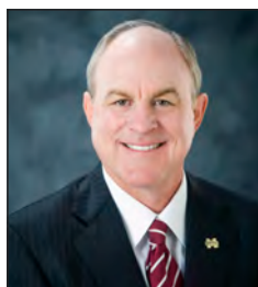
Ben Howland Head Coach 5th Season