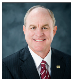
Ben Howland Head Coach 5th Season