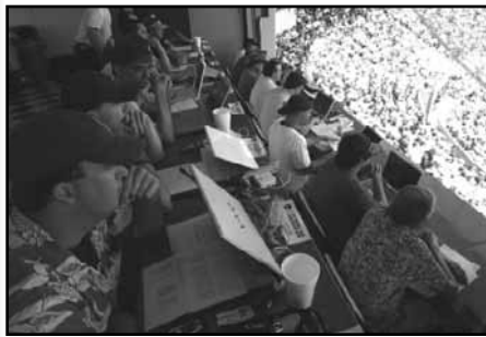
The Joe Phillips Press Box at Dudy Noble Field